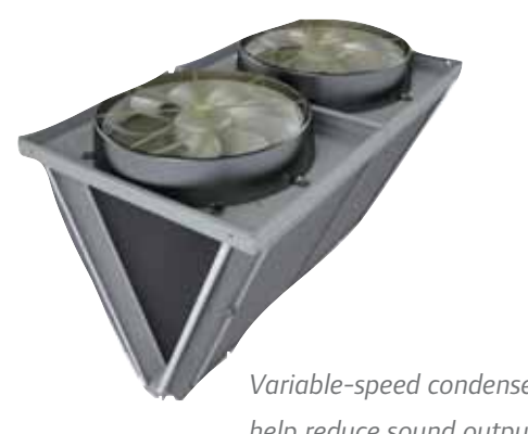
Variable-speed condenser coil fans help reduce sound output.

For additional sound reduction, our InvisiSound Superior package adds acoustical treatments to key soundgenerating components, including the compressor's suction