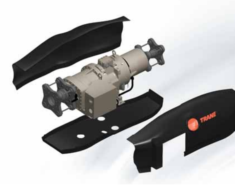
Patented compressor enclosure and metallic bellows absorb vibrations from normal compressor operation.

The InvisiSound Ultimate package also includes a userselectable noise-reduction mode that can be activated to limit the maximum condenser fan speed, achieving even lower sound levels. This feature allows you to actively manage the unit's operation to comply with nighttime and weekend noise restrictions.